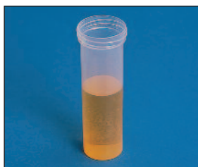
GhostWipes totally dissolve during digestion for easy analysis.