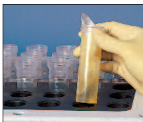
Digest as usual in acid solution.