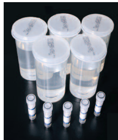
Microbiology Standards are sold in 5 or 20 sample kits. Pellets are packaged in individual vials.